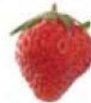
MARA DES BOIS